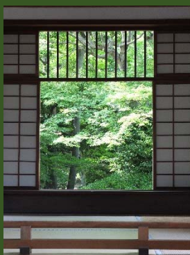
Genkoan, Takaga-mine, Kyoto

IHTC-16 will be held in August 10-15, 2018 in Beijing, China.